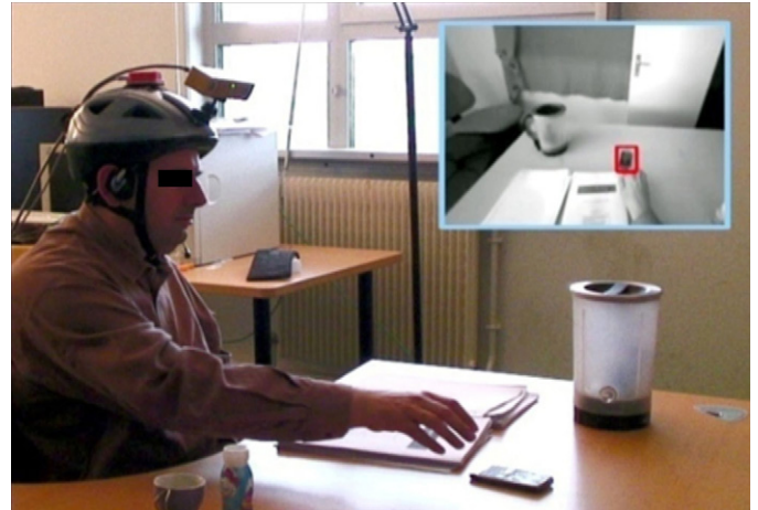
Fig. 1. Picture of a user with the NAVIG prototype. The camera view is shown in inset in the right corner. The user interacts with the system via voice recognition; in this case, he would like to grab his phone, the system then activates the search of the corresponding models. The phone is detected in the camera view (rectangle in the inset). A dynamic virtual sound indicating the object position is provided to the user.

The absence of pedestrian features in databases represents a major challenge to the effectiveness of Geographical Information System (GIS) based personal guidance system [21]. It is obvious that the presence of walking pathways (e.g. sidewalks