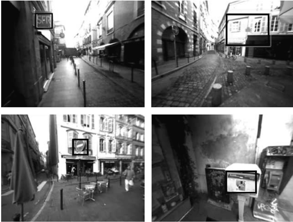
Fig. 2. Examples of geolocated visual landmarks (visual reference points) used for user-positioning. The rectangles indicate target detection in the camera view. Up left: shop sign, up right: facade, down left: road sign, and down right: mailbox.