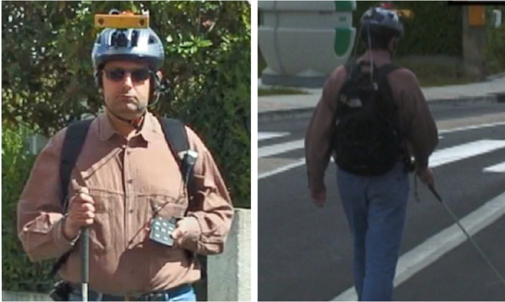
Fig. 4. Left: the NAVIG Prototype including stereoscopic cameras, GPS, sensors, microphone, headphones, and a computer in a backpack. Right: blind user with the NAVIG prototype during a preliminary test.